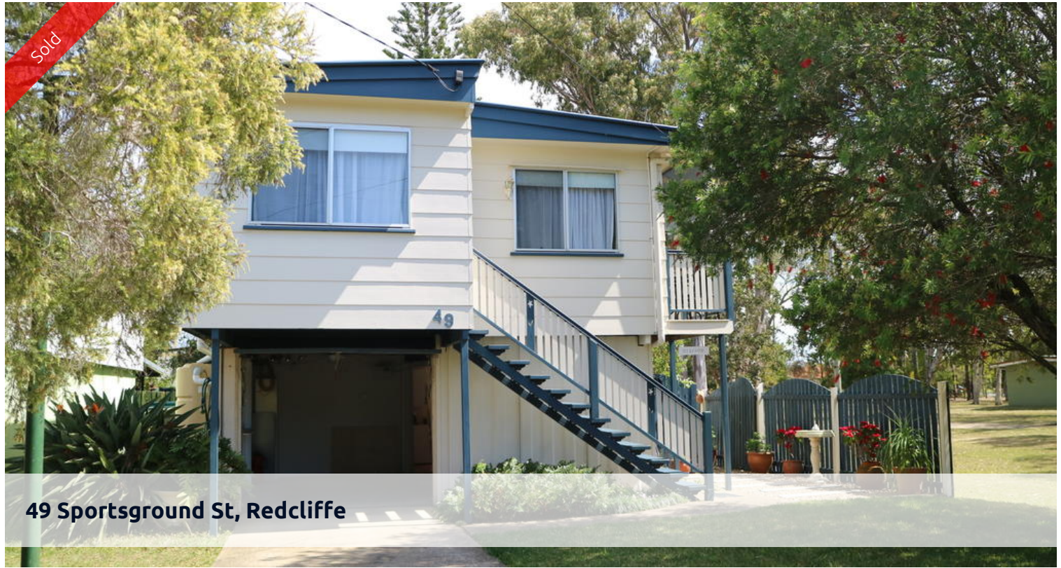
49 Sportsground St, Redcliffe