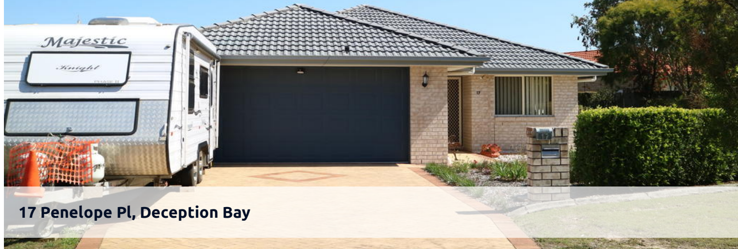
17 Penelope Pl, Deception Bay