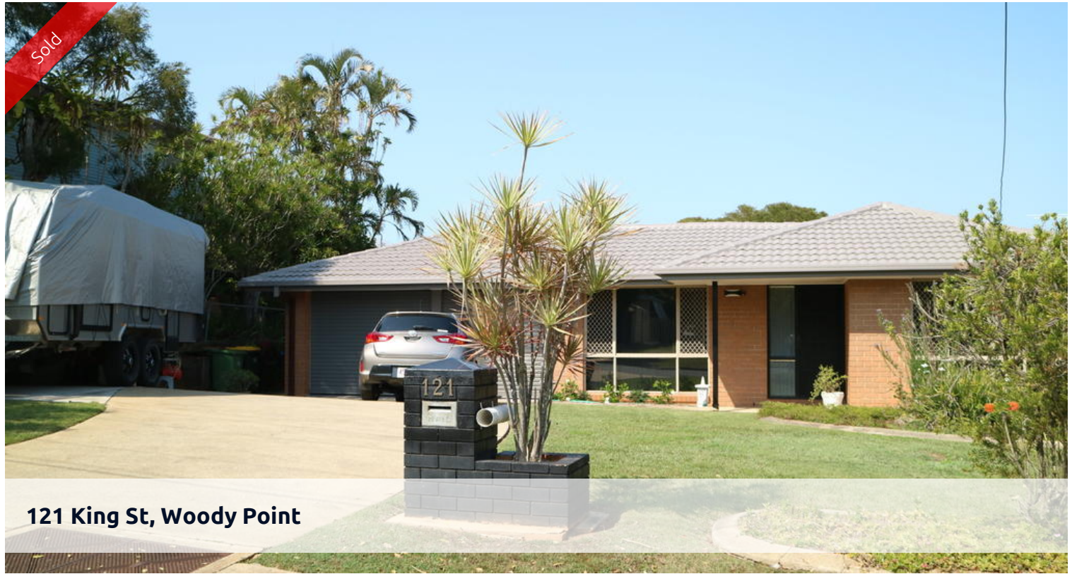
121 King St, Woody Point