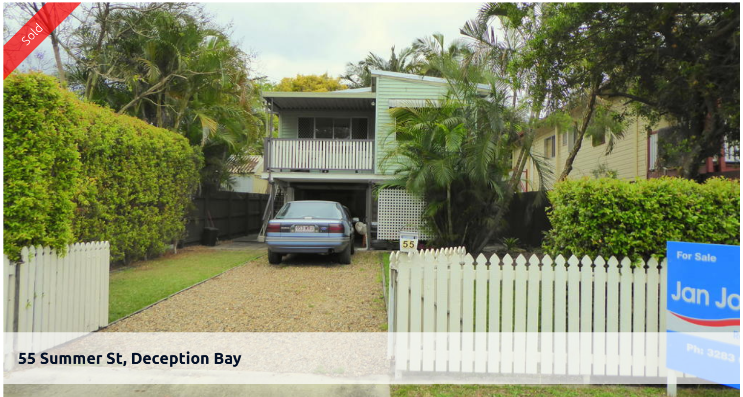
55 Summer St, Deception Bay