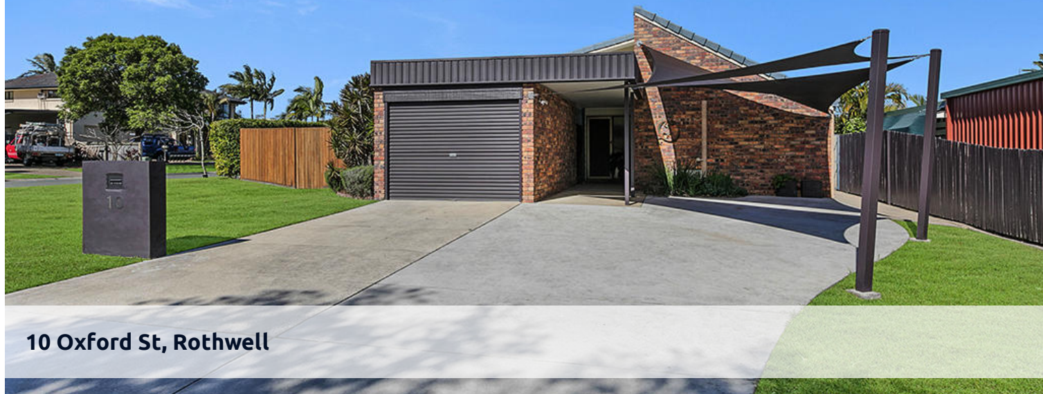
10 Oxford St, Rothwell