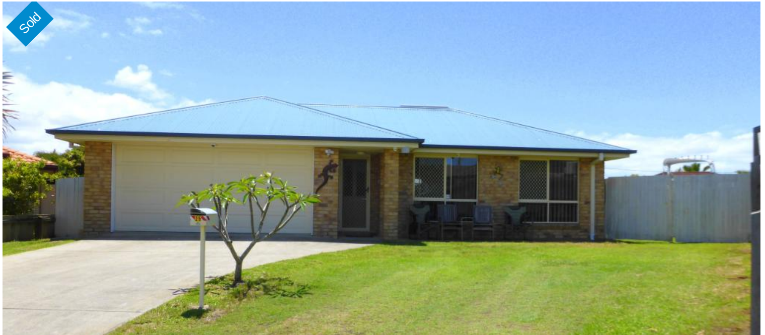
25 Penelope Place, Deception Bay