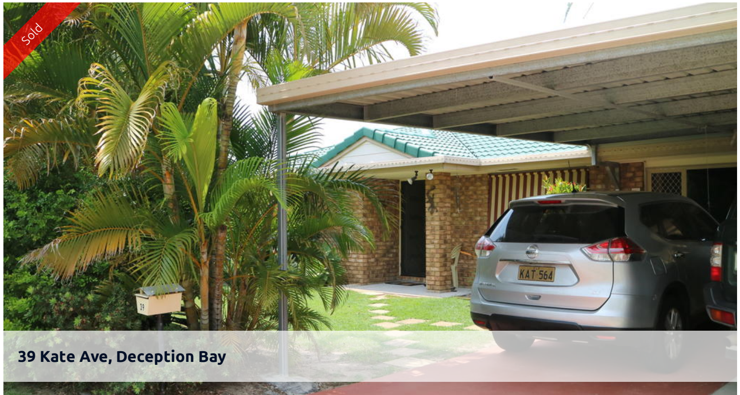
39 Kate Ave, Deception Bay