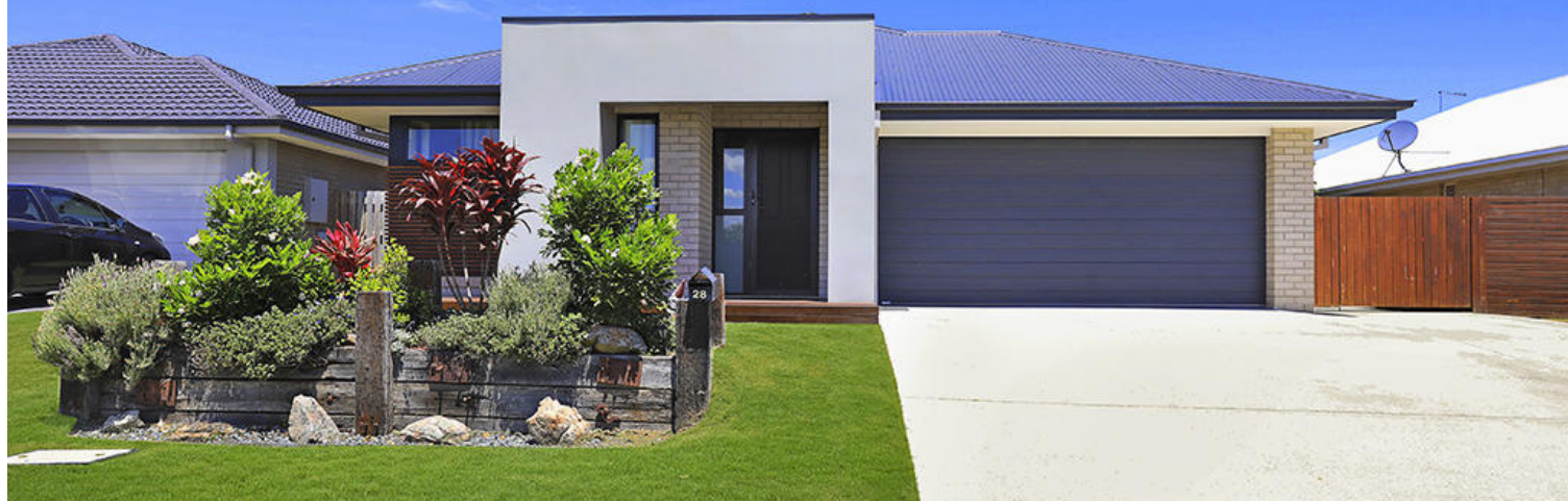
28 Abercrombie Street, Mango Hill