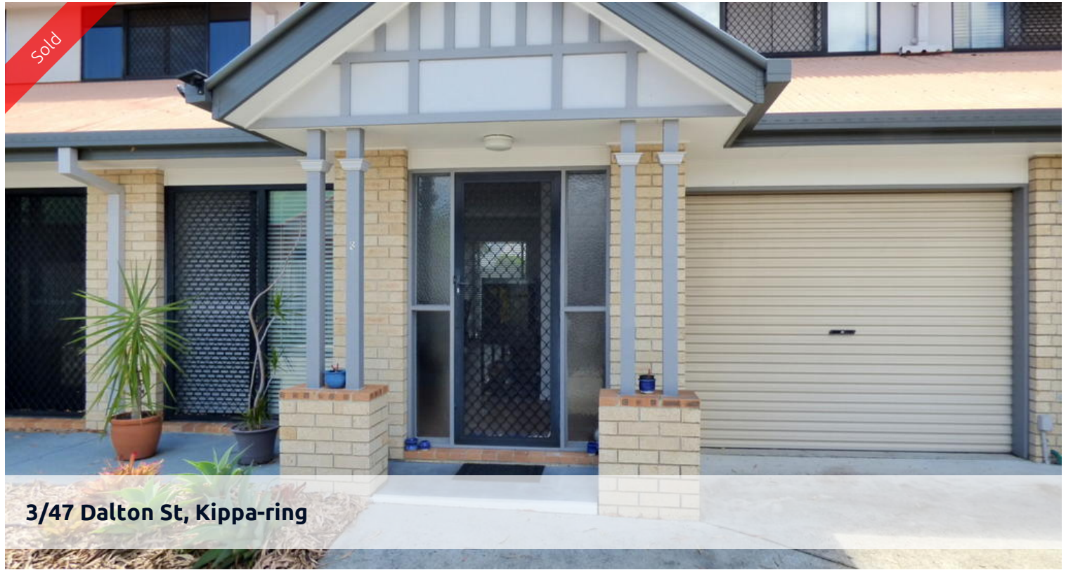
3/47 Dalton St, Kippa-ring