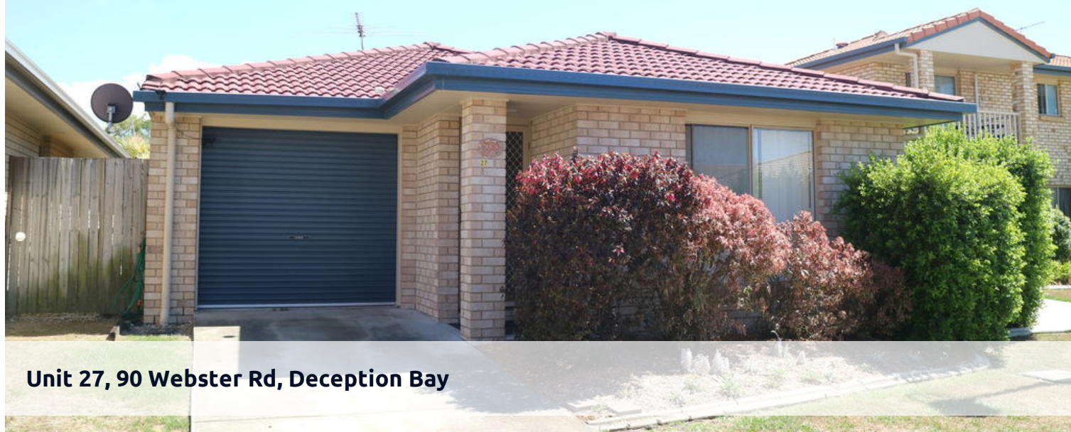
Unit 27, 90 Webster Rd, Deception Bay