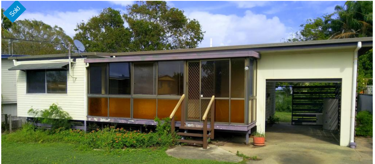
20 Prenter Cres, Kippa-ring