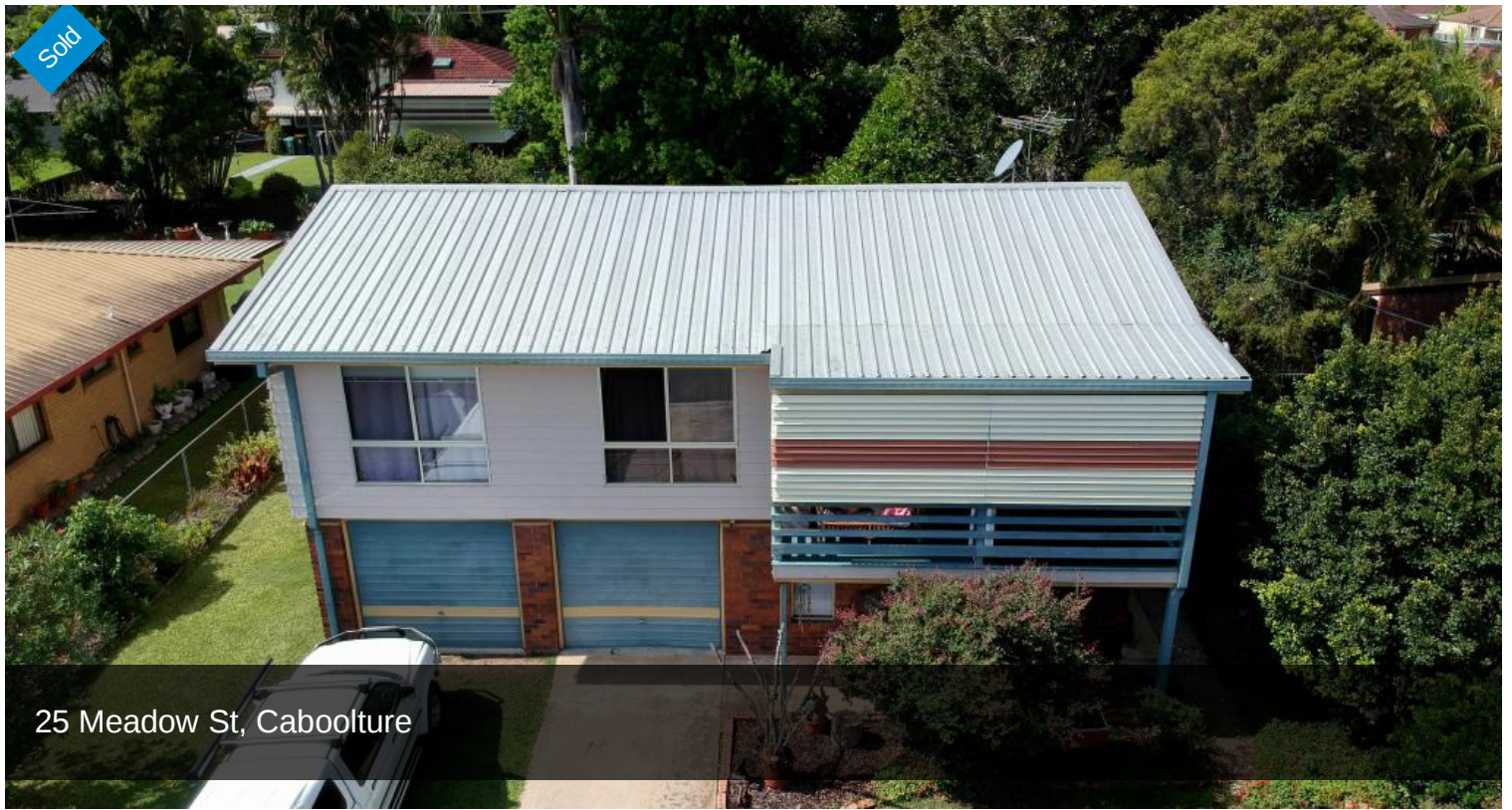
25 Meadow St, Caboolture