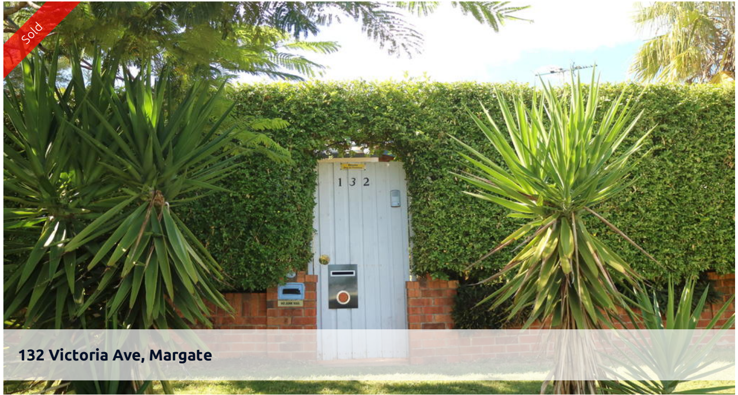
132 Victoria Ave, Margate