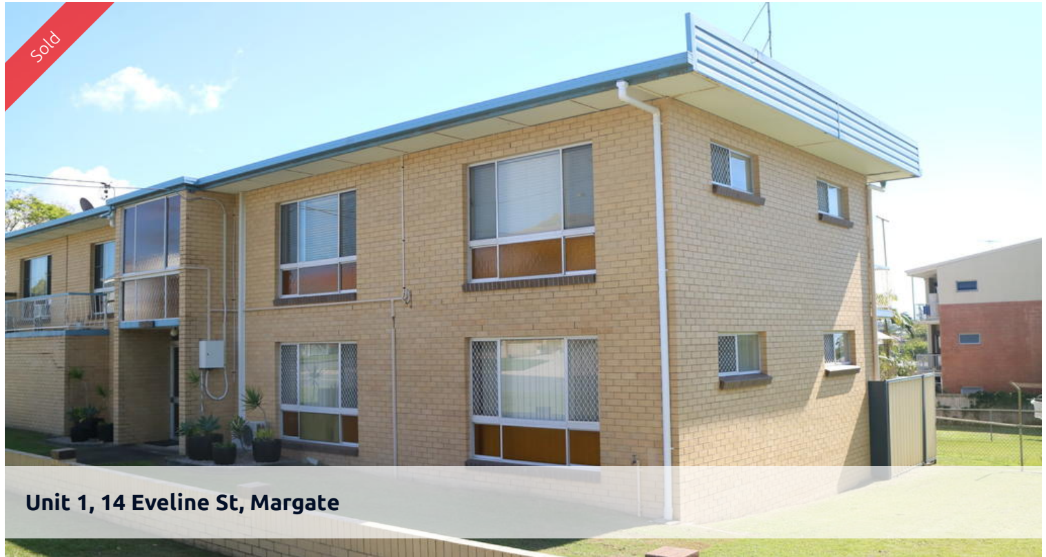
Unit 1, 14 Eveline St, Margate