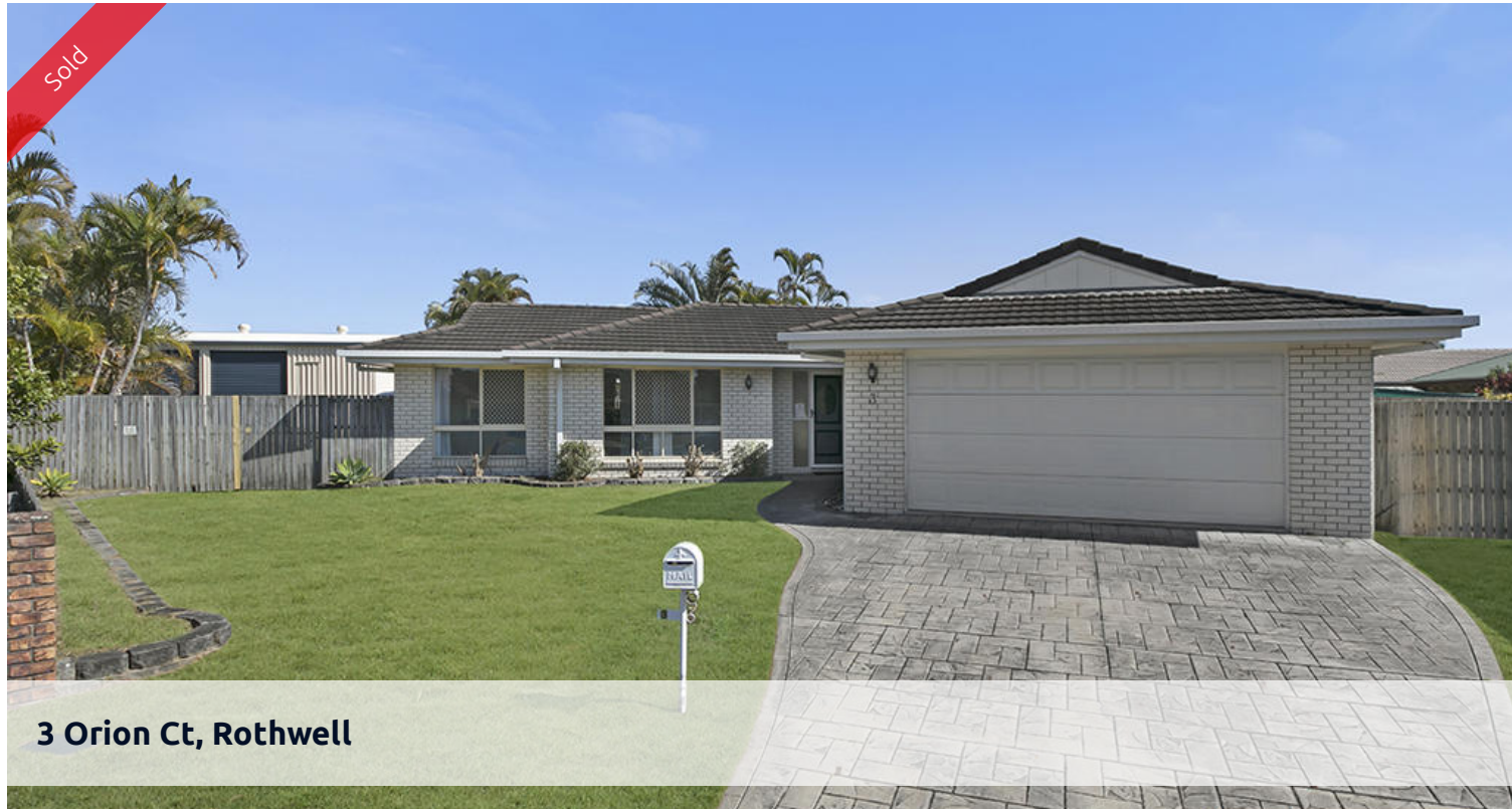
3 Orion Ct, Rothwell