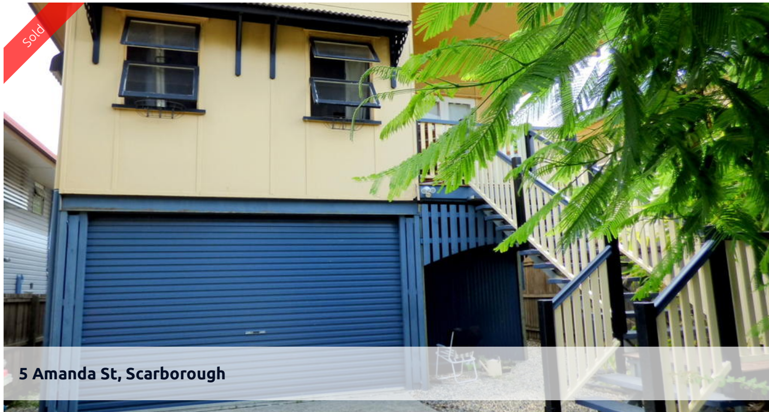
5 Amanda St, Scarborough