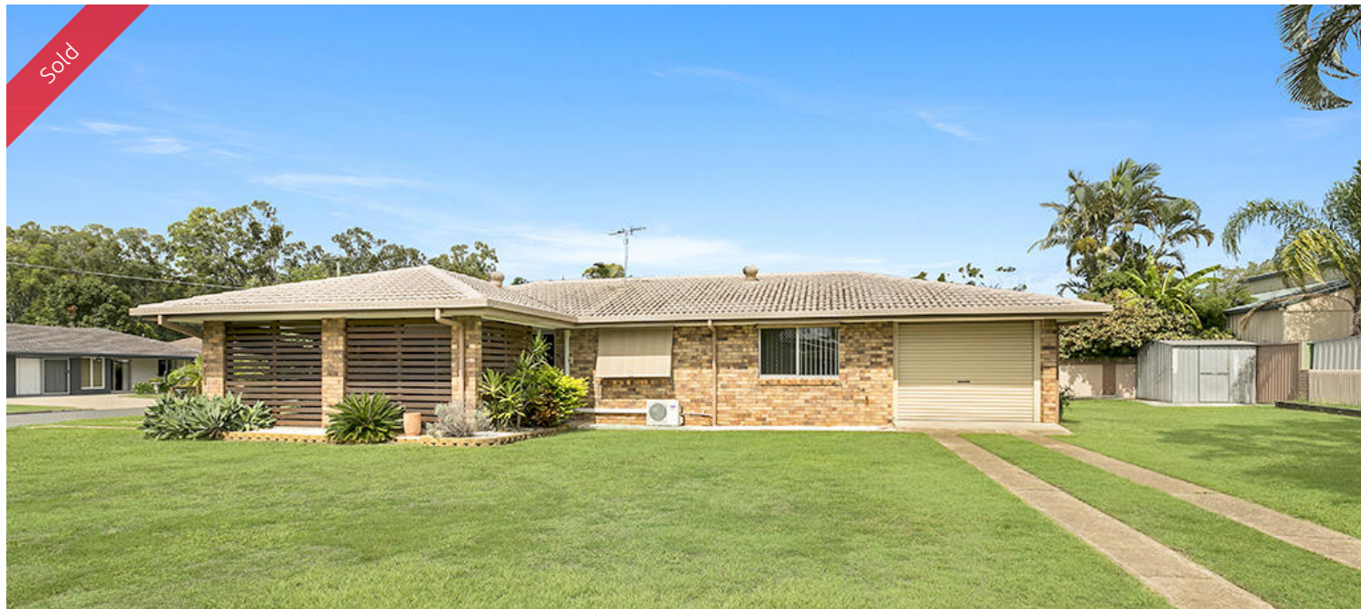
15 Daniel Ct, Scarborough