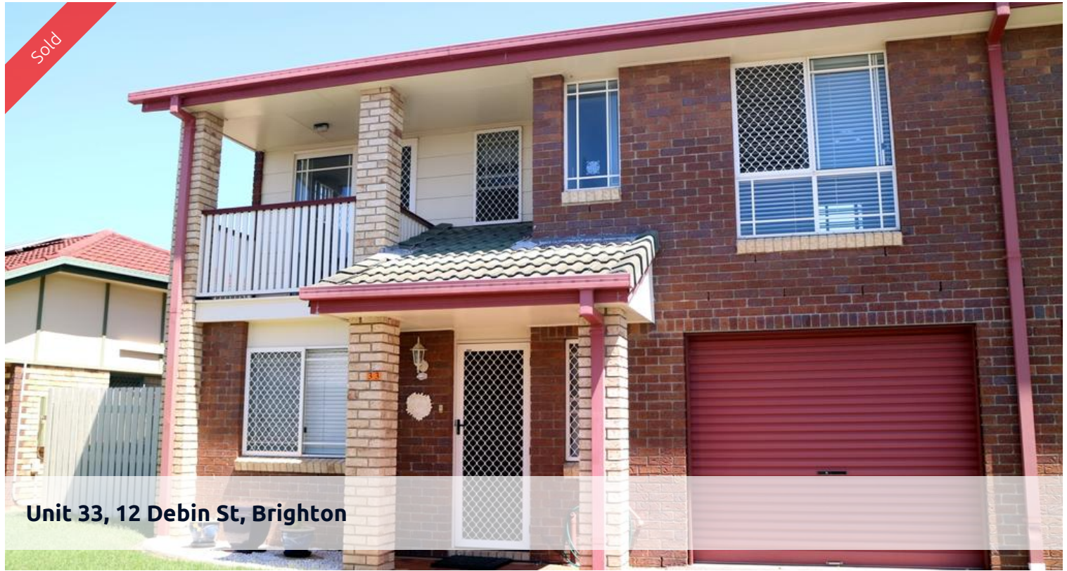
Unit 33, 12 Debin St, Brighton