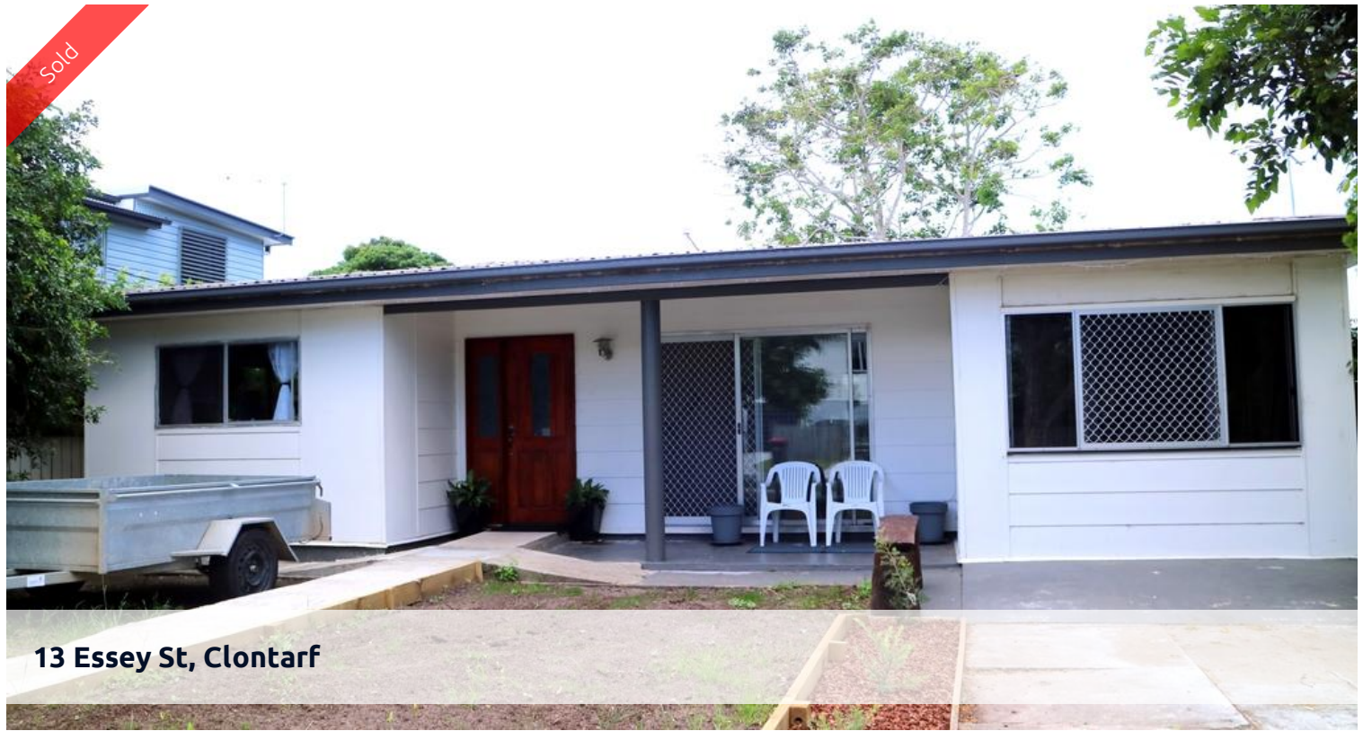
13 Essey St, Clontarf