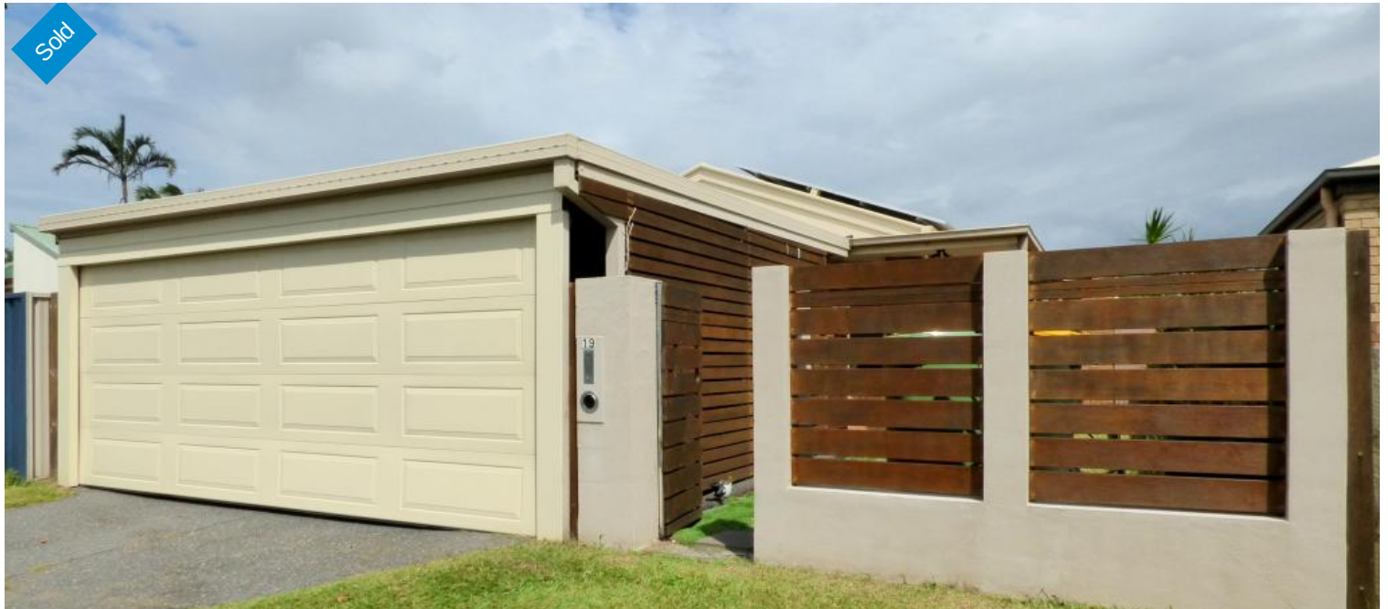
19 Greene St, Rothwell