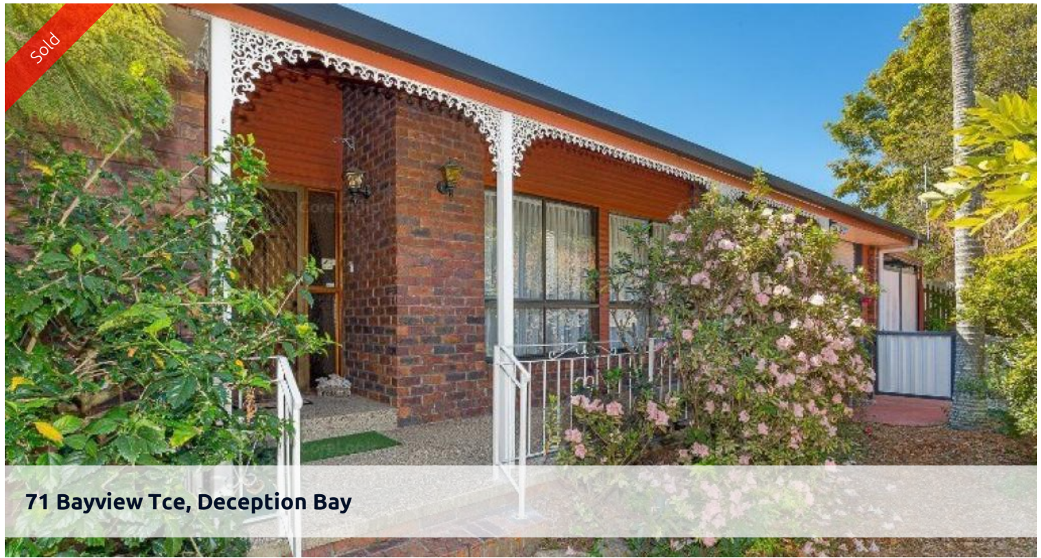
71 Bayview Tce, Deception Bay