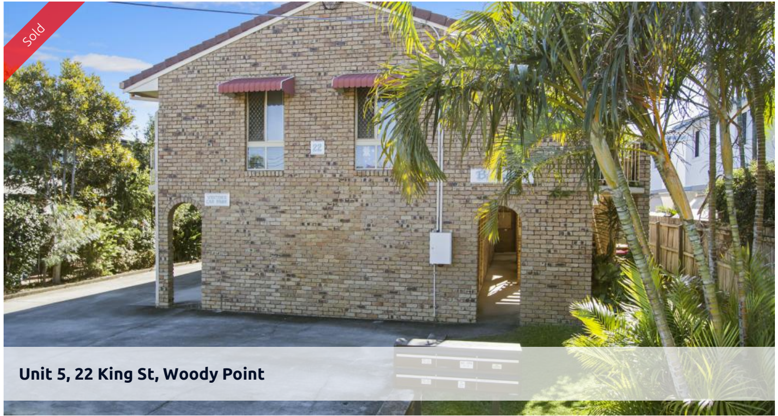
Unit 5, 22 King St, Woody Point