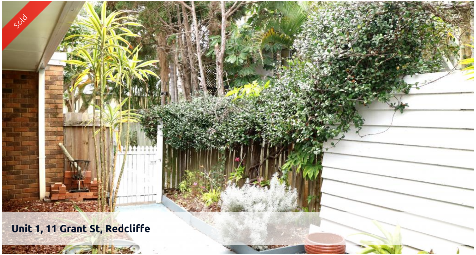
Unit 1, 11 Grant St, Redcliffe