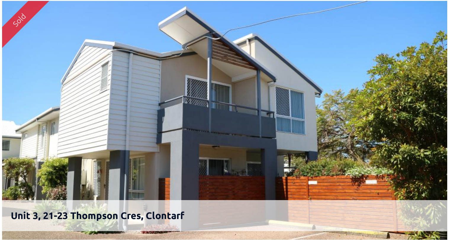
Unit 3, 21-23 Thompson Cres, Clontarf