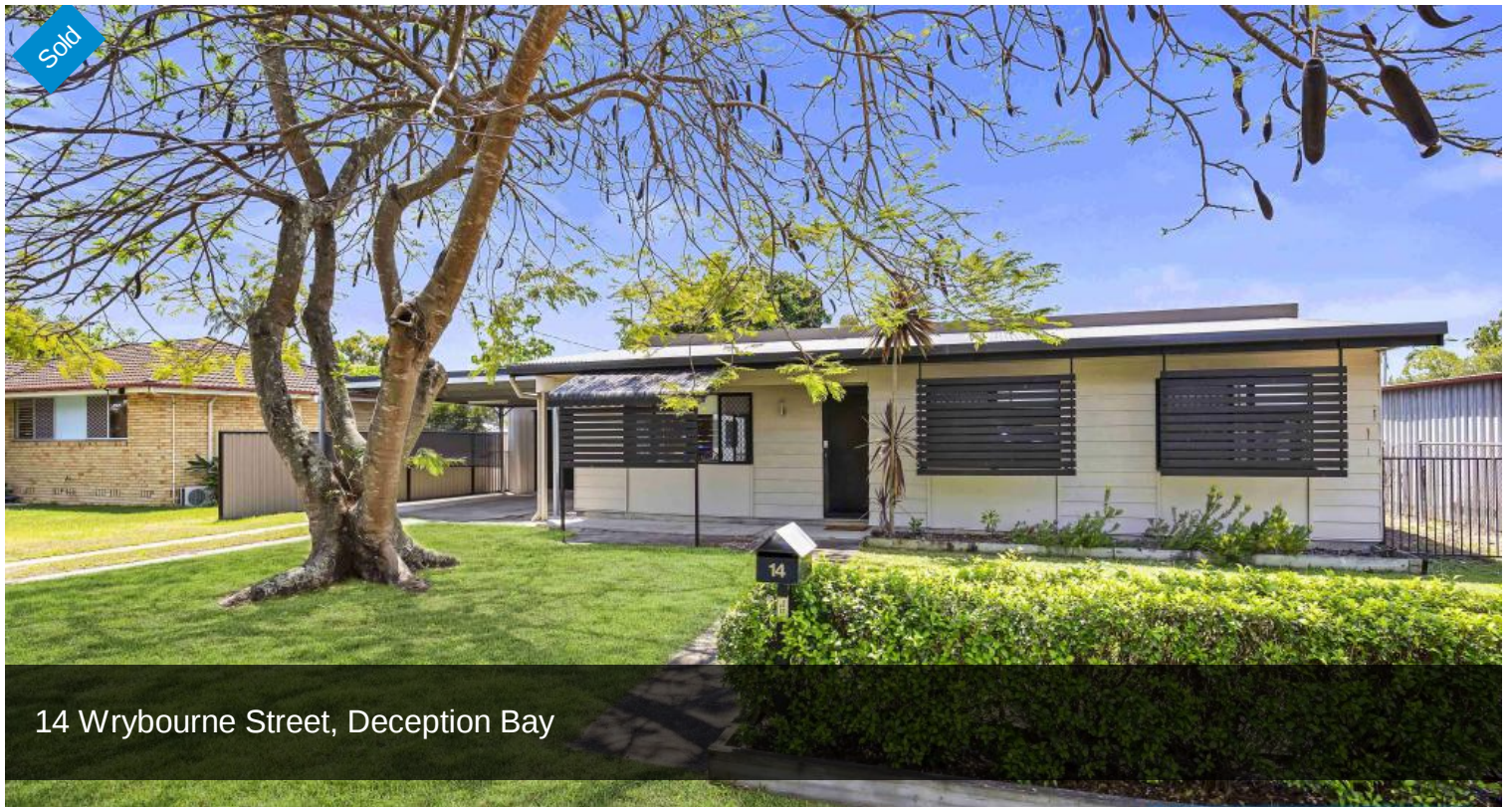
14 Wrybourne Street, Deception Bay