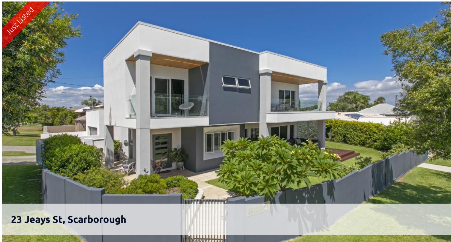
23 Jeays St, Scarborough