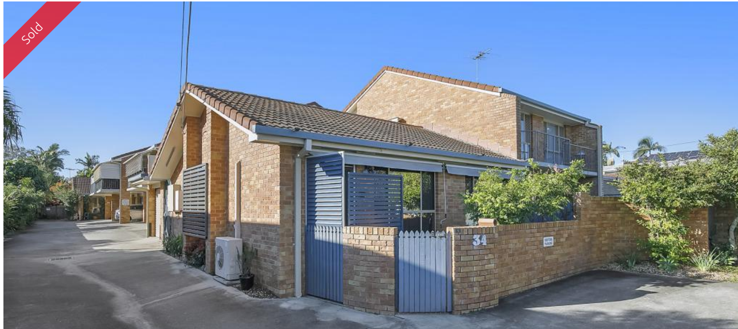
Unit 1, 34 Caroline St, Woody Point