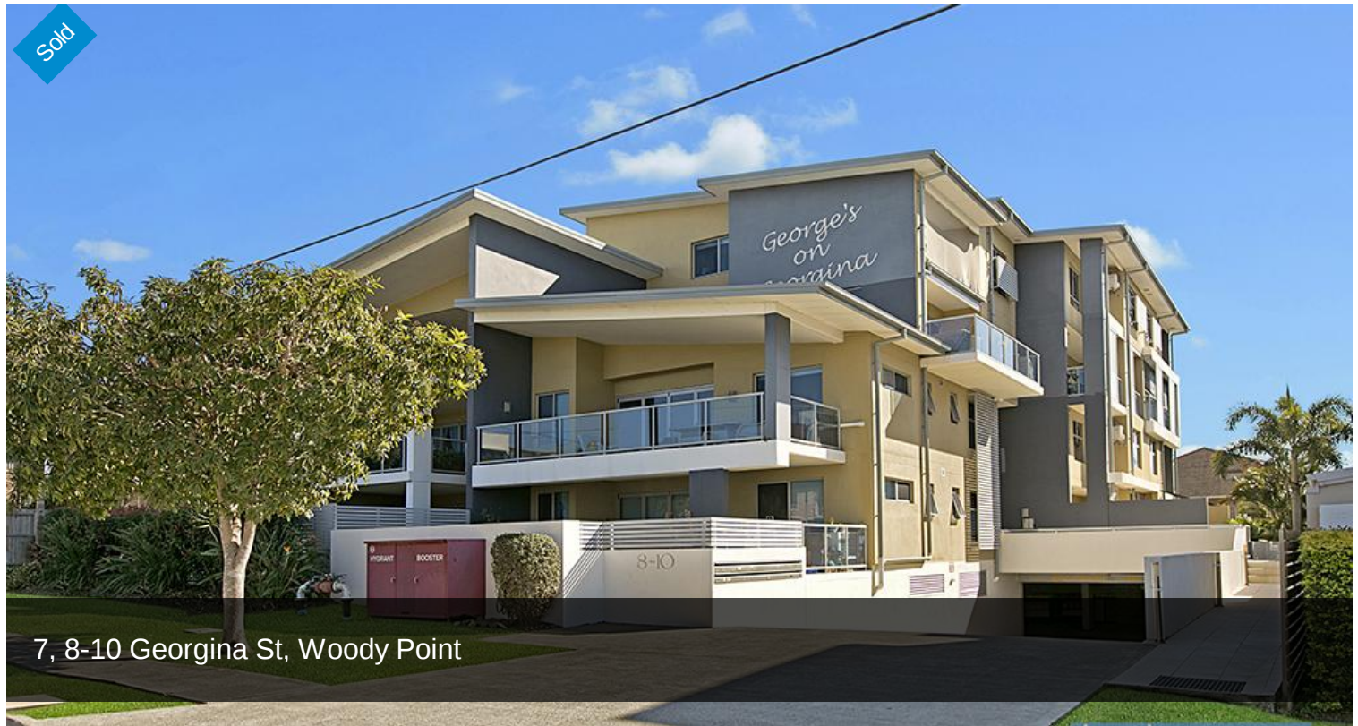
7, 8-10 Georgina St, Woody Point