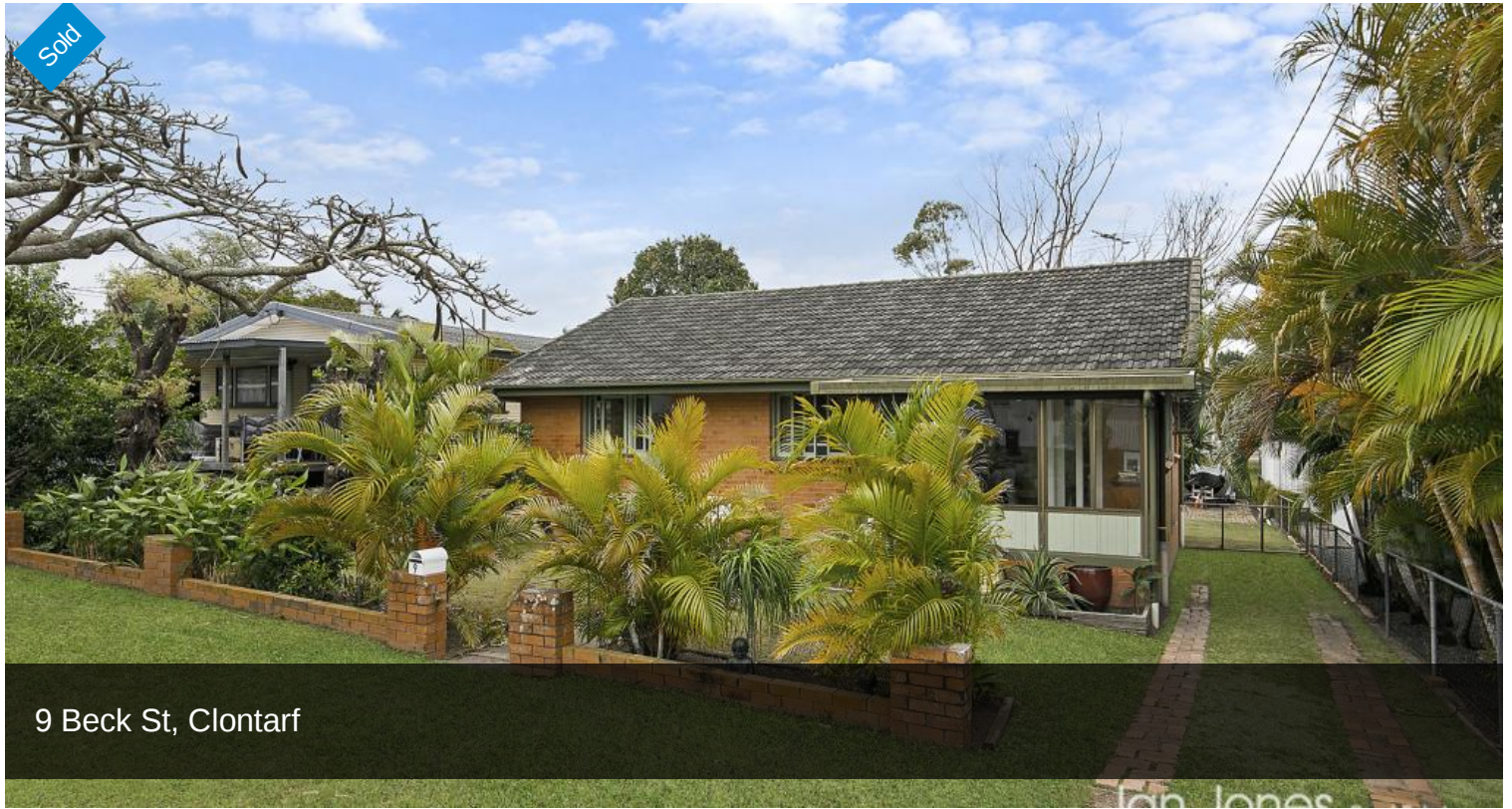
9 Beck St, Clontarf