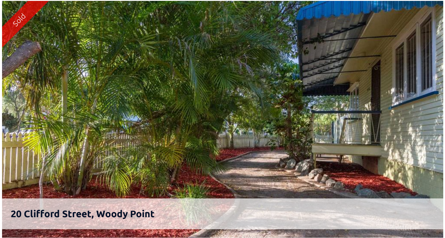
20 Clifford Street, Woody Point