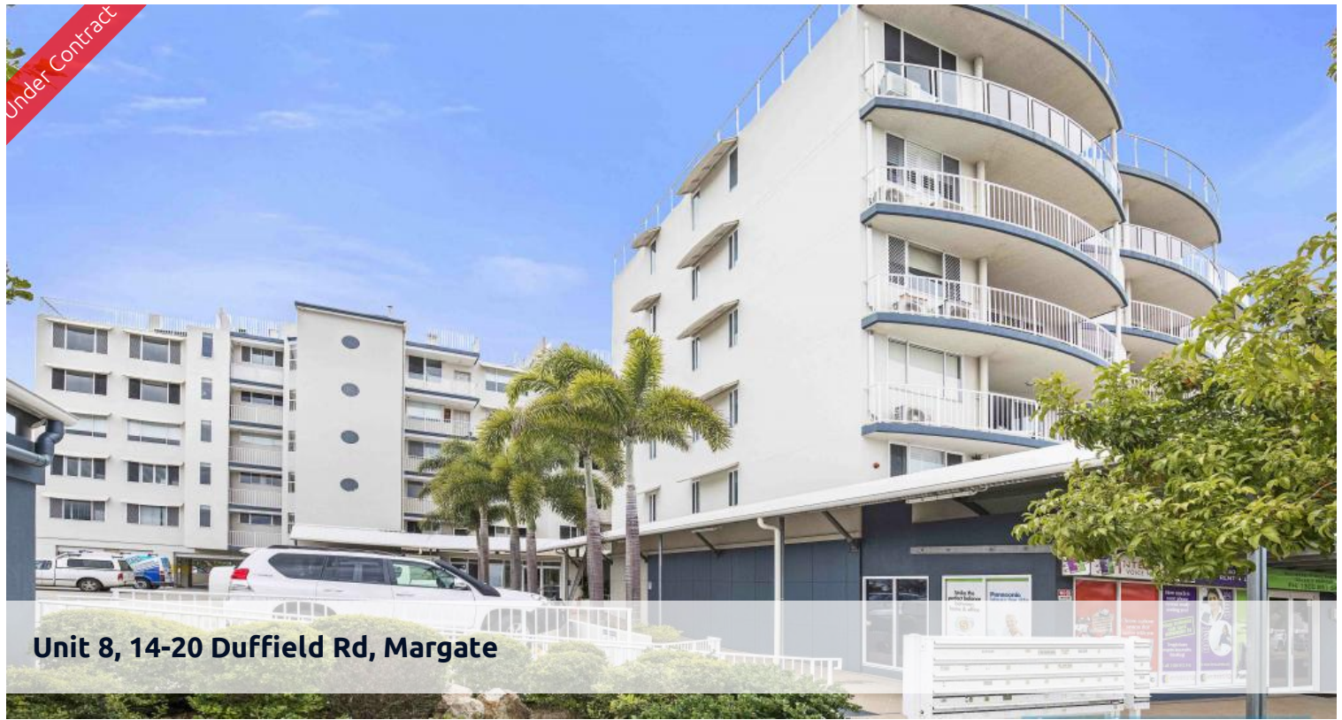
Unit 8, 14-20 Duffield Rd, Margate