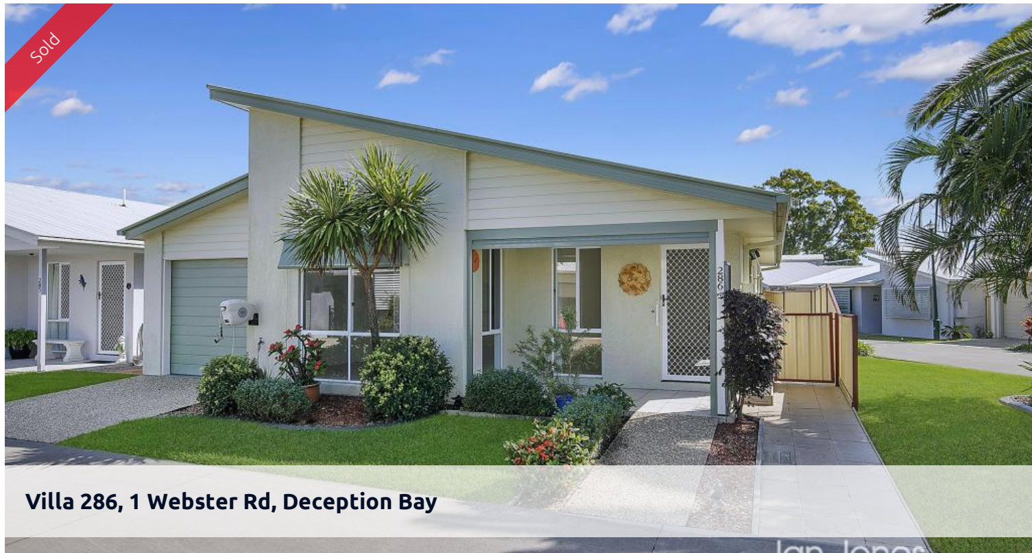
Villa 286, 1 Webster Rd, Deception Bay