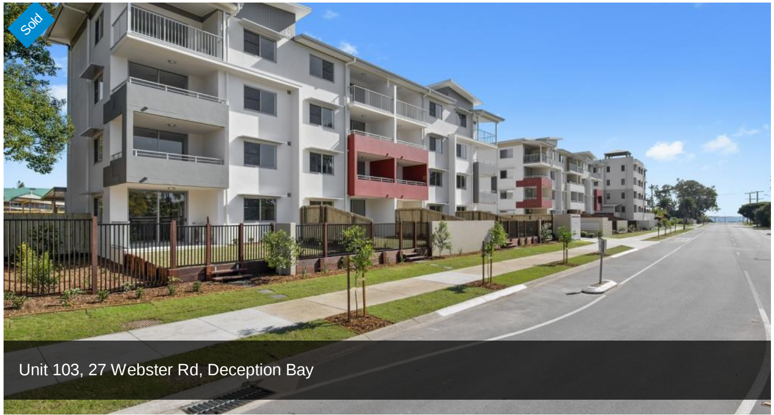
Unit 103, 27 Webster Rd, Deception Bay