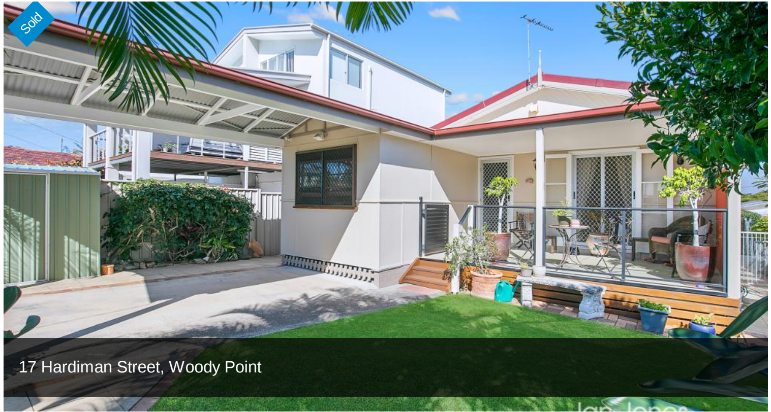
17 Hardiman Street, Woody Point