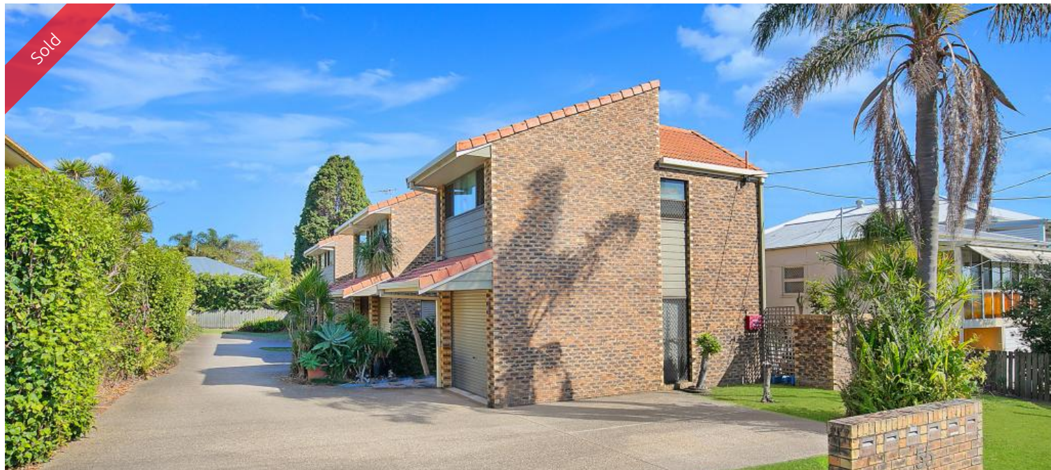
Unit 3, 55 Ernest St, Margate