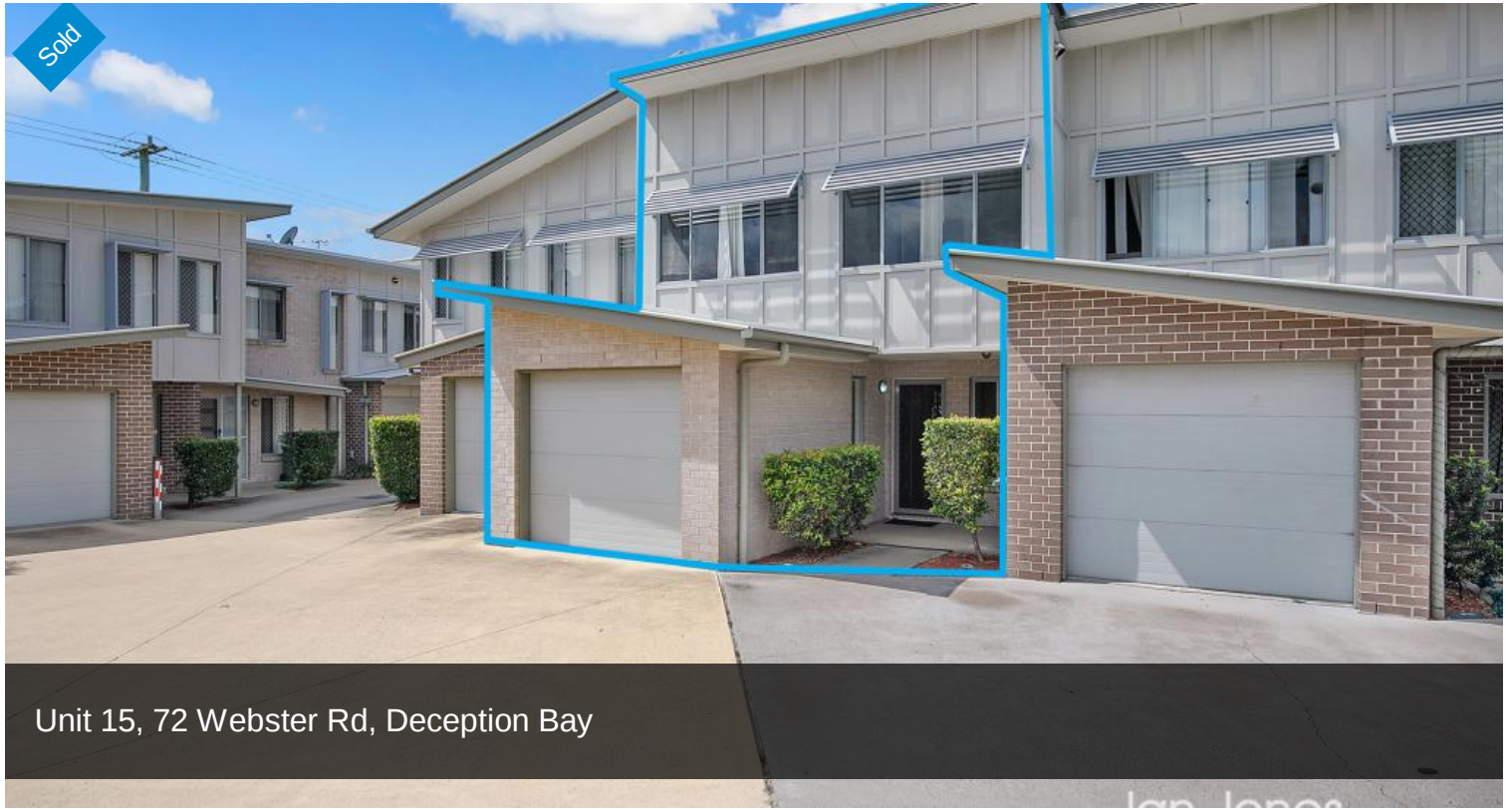
Unit 15, 72 Webster Rd, Deception Bay