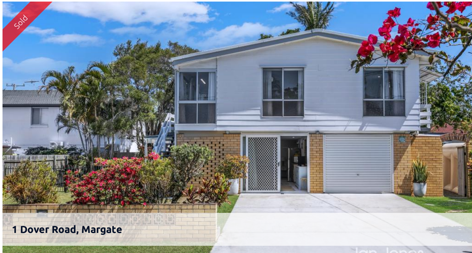
1 Dover Road, Margate