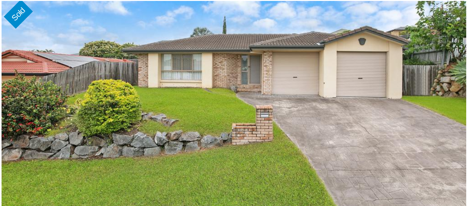
3 Triantha Ct, Albany Creek