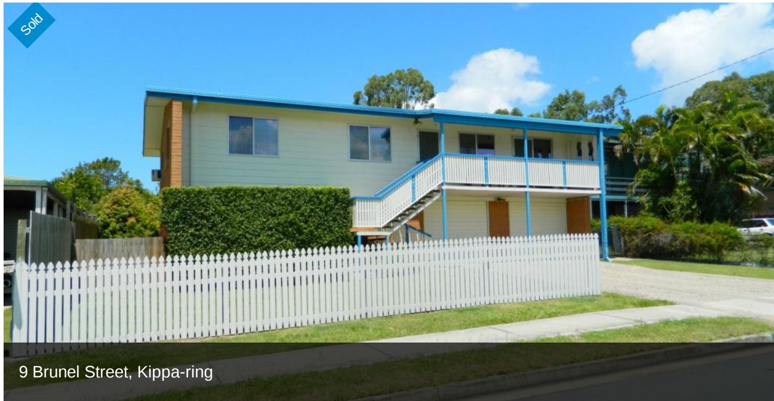
9 Brunel Street, Kippa-ring