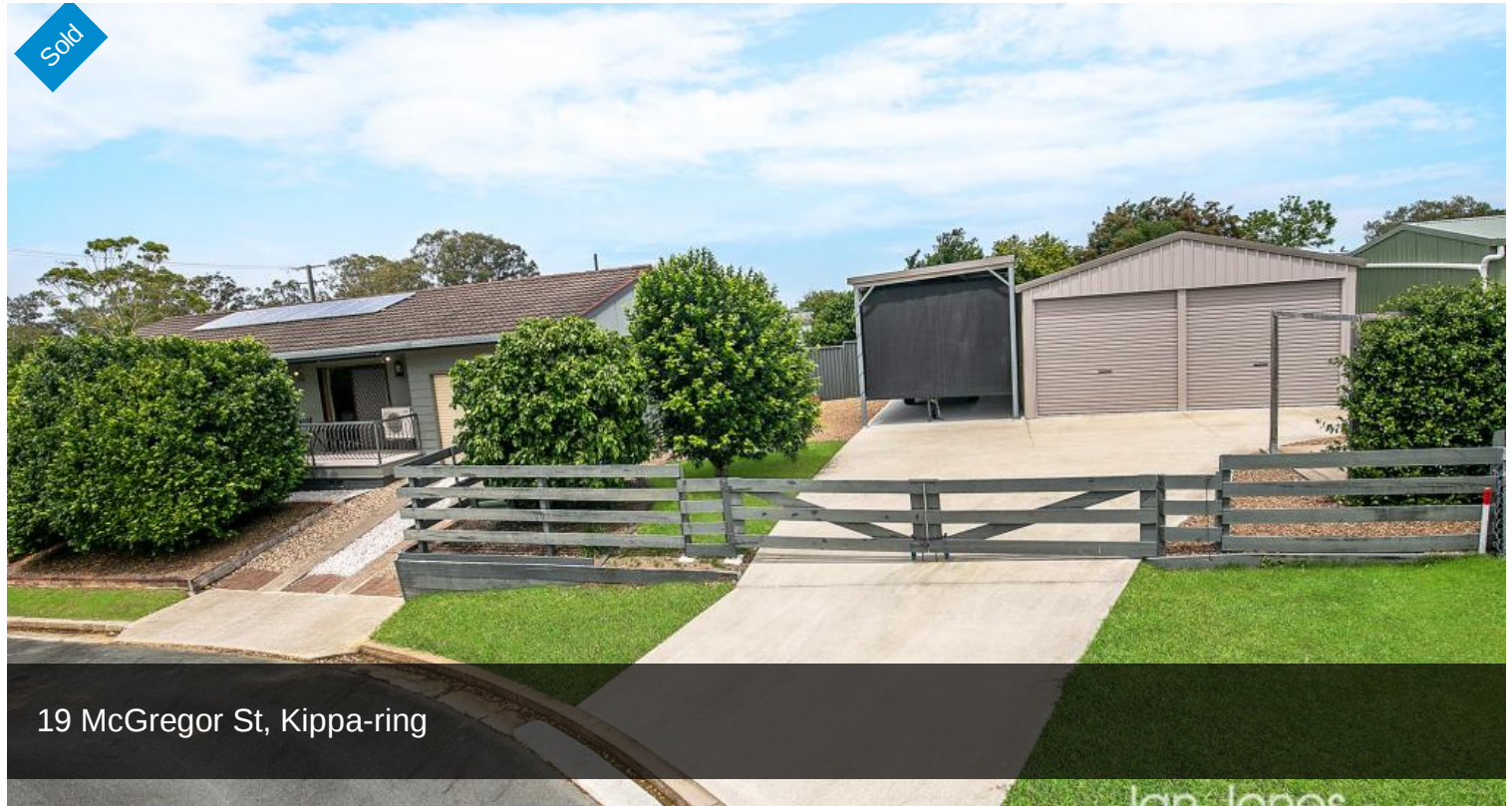
19 McGregor St, Kippa-ring