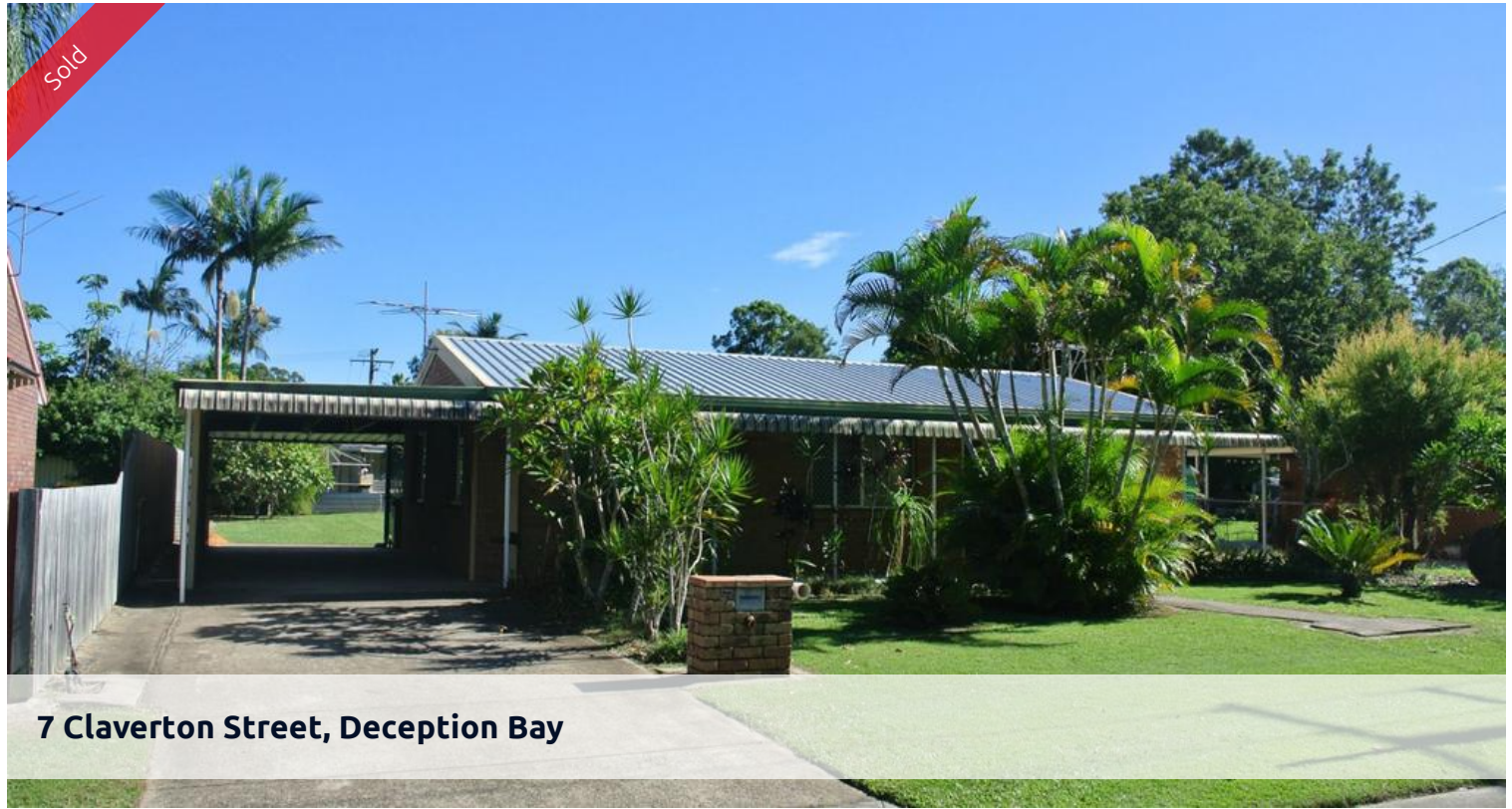
7 Claverton Street, Deception Bay