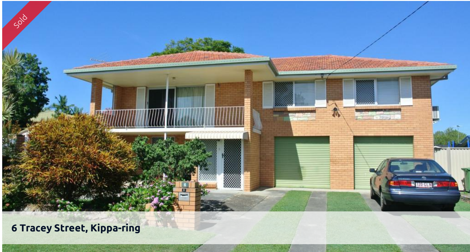
6 Tracey Street, Kippa-ring