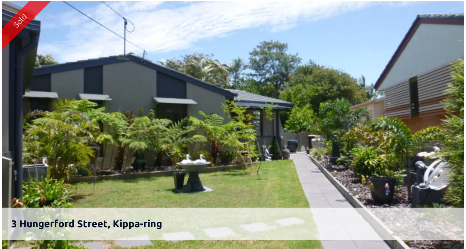
3 Hungerford Street, Kippa-ring