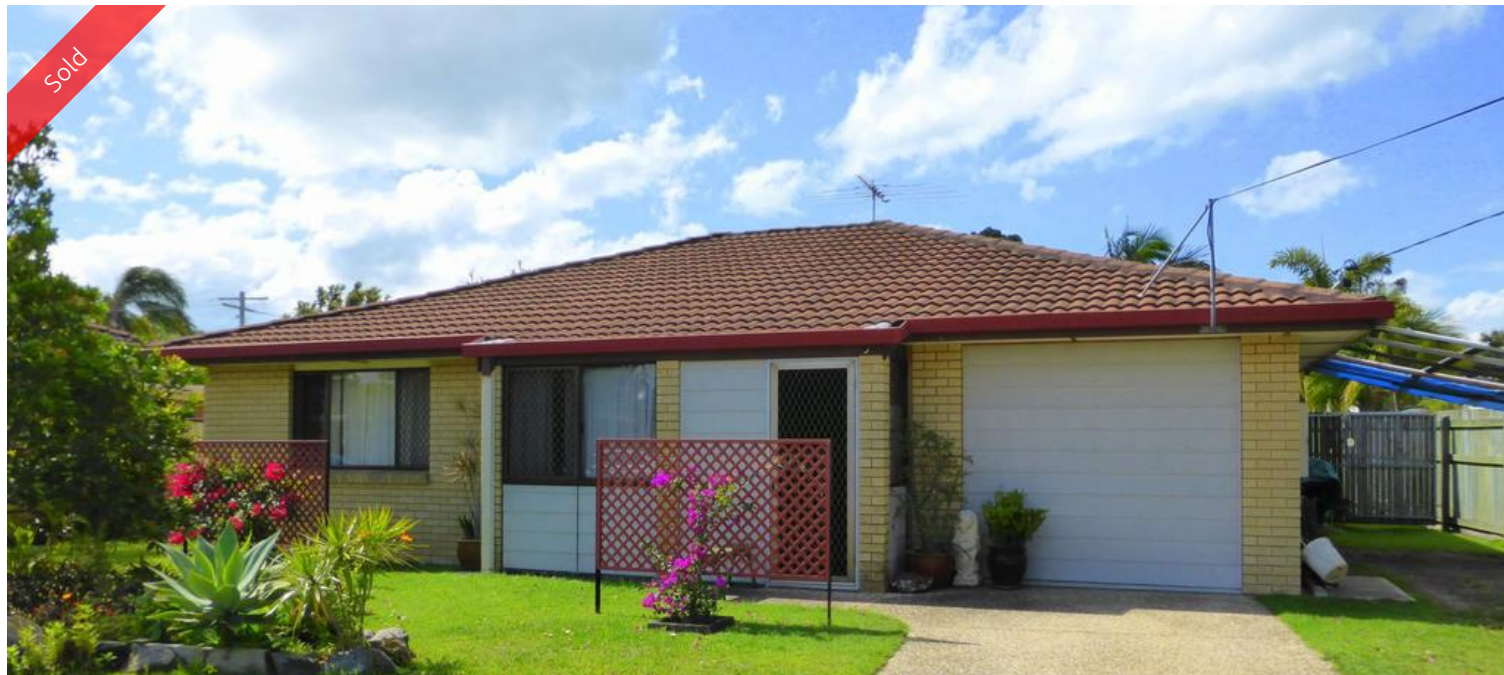
14 Raintree Street, Kippa-ring