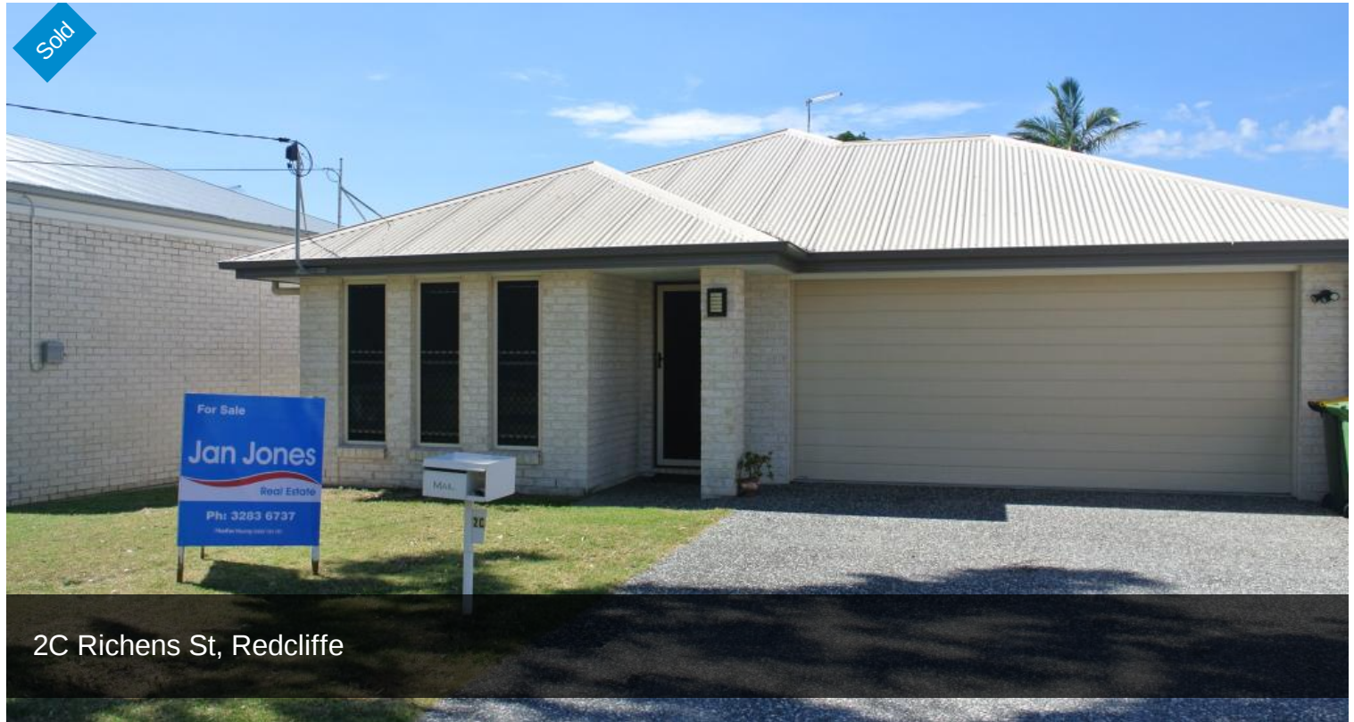
2C Richens St, Redcliffe