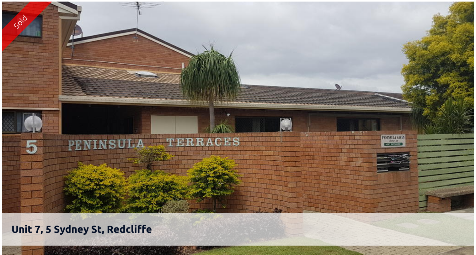
Unit 7, 5 Sydney St, Redcliffe