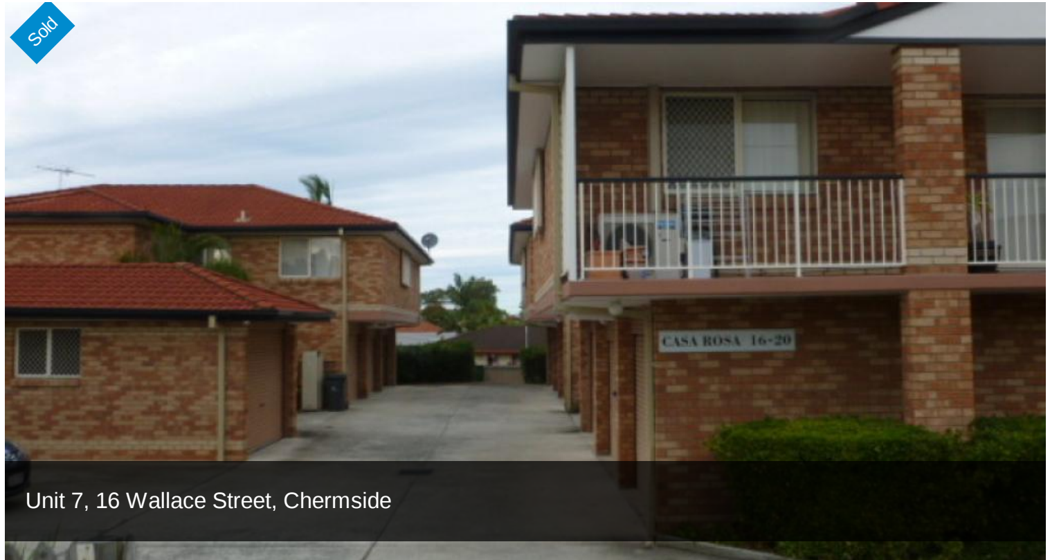
Unit 7, 16 Wallace Street, Chermside