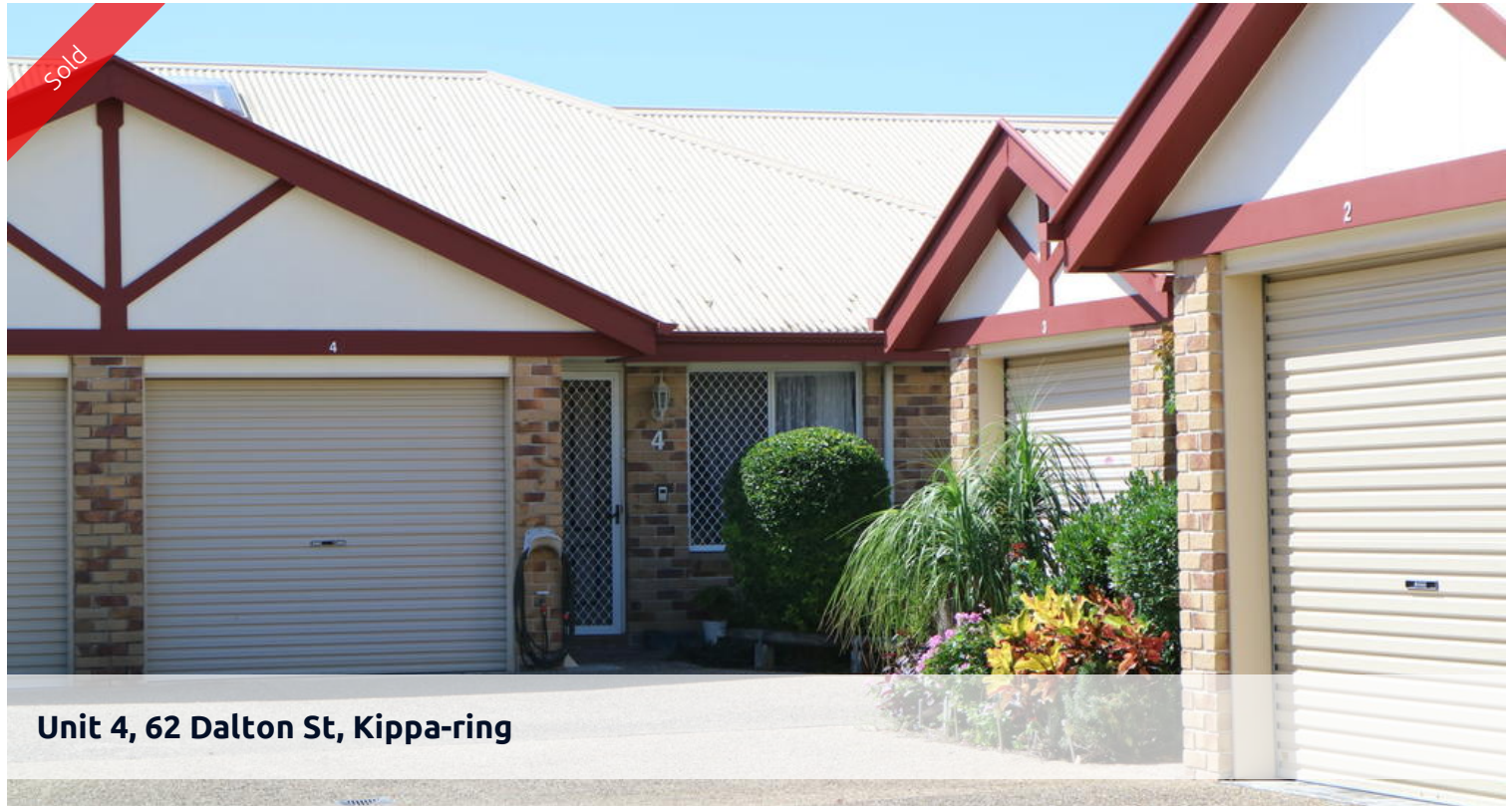
Unit 4, 62 Dalton St, Kippa-ring