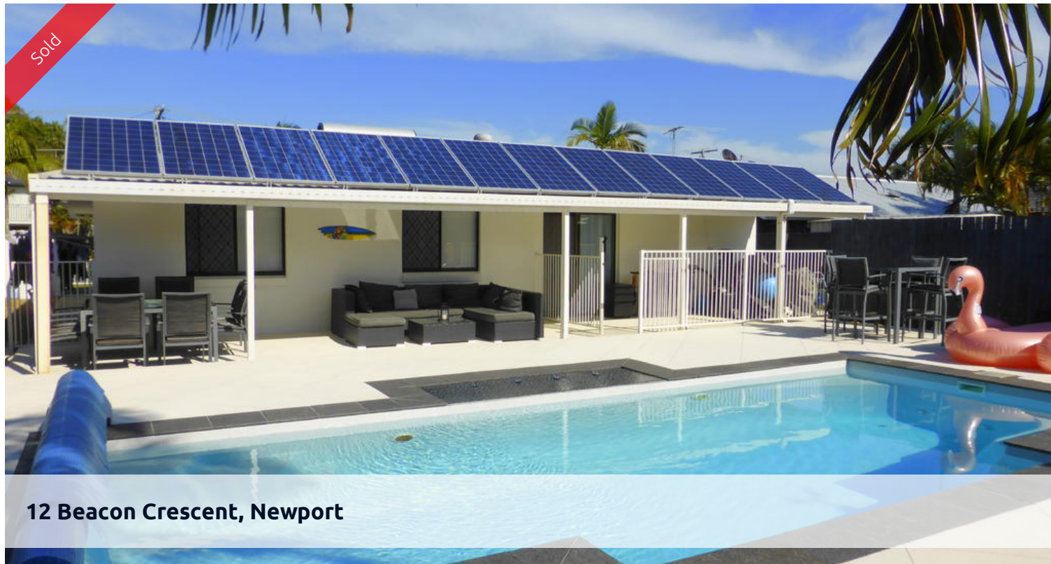
12 Beacon Crescent, Newport