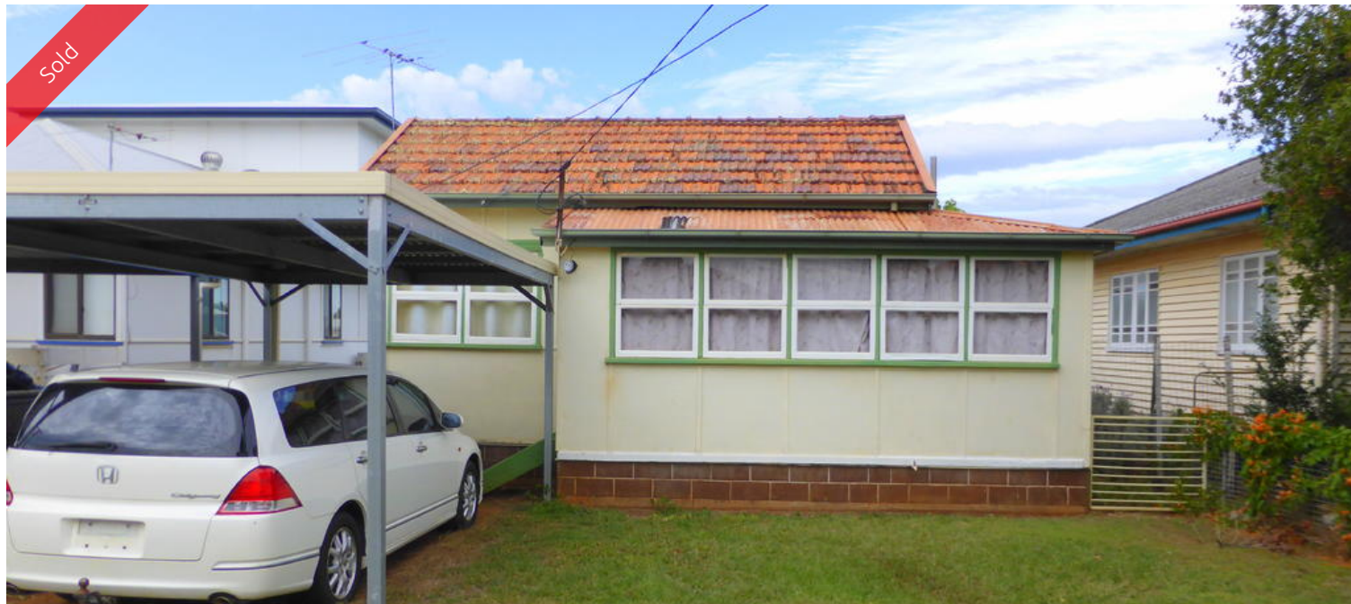
33 Dodds Street, Margate